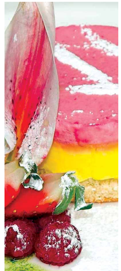
Lemon and strawberry parfait, with fresh berries.