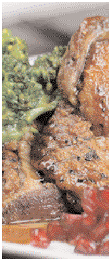
Duck breast with orange, pomegranate and red wine sauce