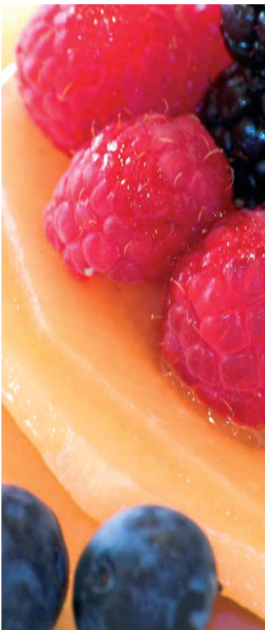
Fresh fruits combined to form a perfect starter course.

We cater for vegetarian and other diets and we're happy to provide simpler dishes for children.